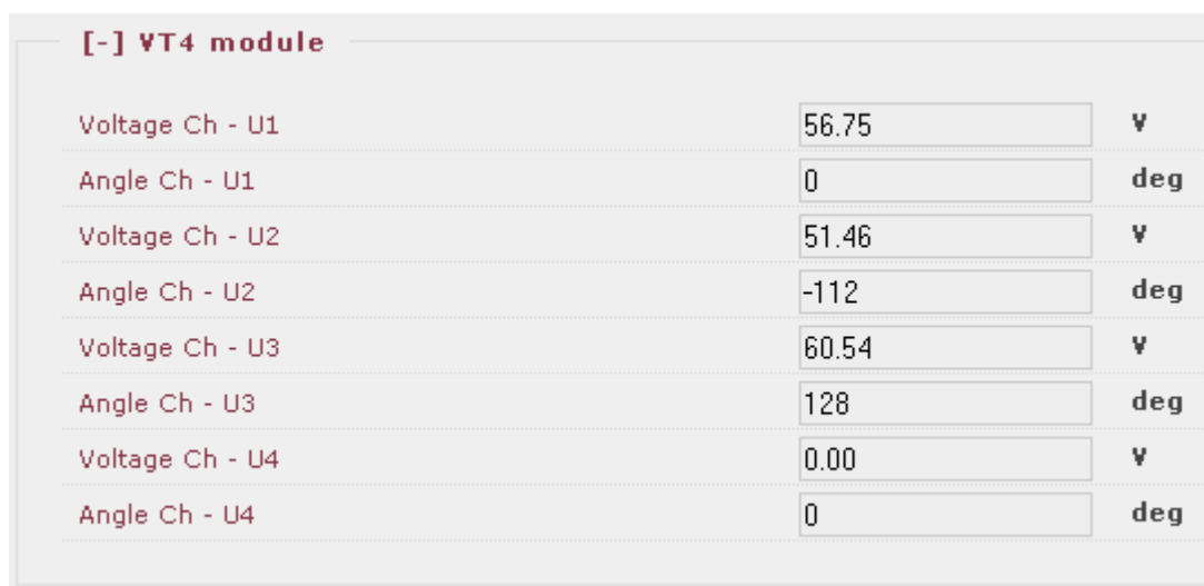
Figure 5 - Example: On-line displayed values for the voltage input module

Figure 5 shows an example of how the calculated Fourier components are displayed in the on-line block. (See the document EuroProt+ "Remote user interface description".)