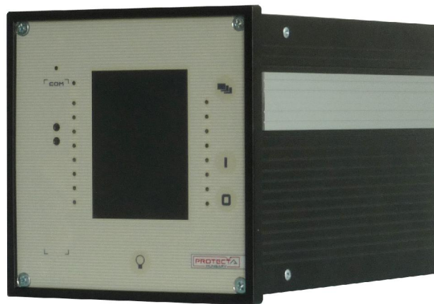
Figure 3 The standard industrial box of EuroProt+ family