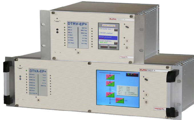
Figure 2 The 42 and 84 inch racks of EuroProt+ family

The basic information for working with the EuroProt+ devices are described in the document " Quick start guide to the devices of the EuroProt+ product line ".